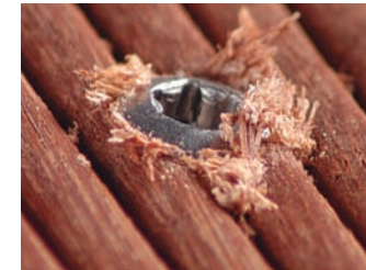
Decking screw without predrilling

We always recommend predrilling in hardwoods.