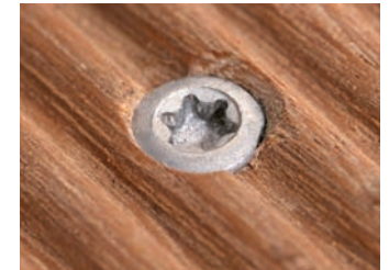
The new HECO-TOPIX®, predrilled